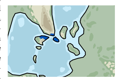
Figure 1: Current Distribution of Yajéé Speakers

The Yajéé [jā.ʤéː] language is spoken by the Yajé people on the islands of Hamar and Hegüü, in the Western Sea, called Ŋeya'aa by the Yajé. Yajéé is descended from Proto-Yajéé, an earlier language originally spoken in the Yajé urheimat of Hamar. The Yajé are voyagers and have explored many of the islands in that area, but at the point of modern Yajéé, they have only established permanent settlements on these two islands. The Yajé have been in constant contact with the Faazngge people on the mainland through a diaspora community there, and have inher-